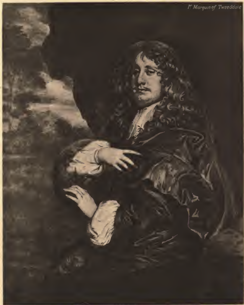
John Hay, First Marquis of Tweeddale